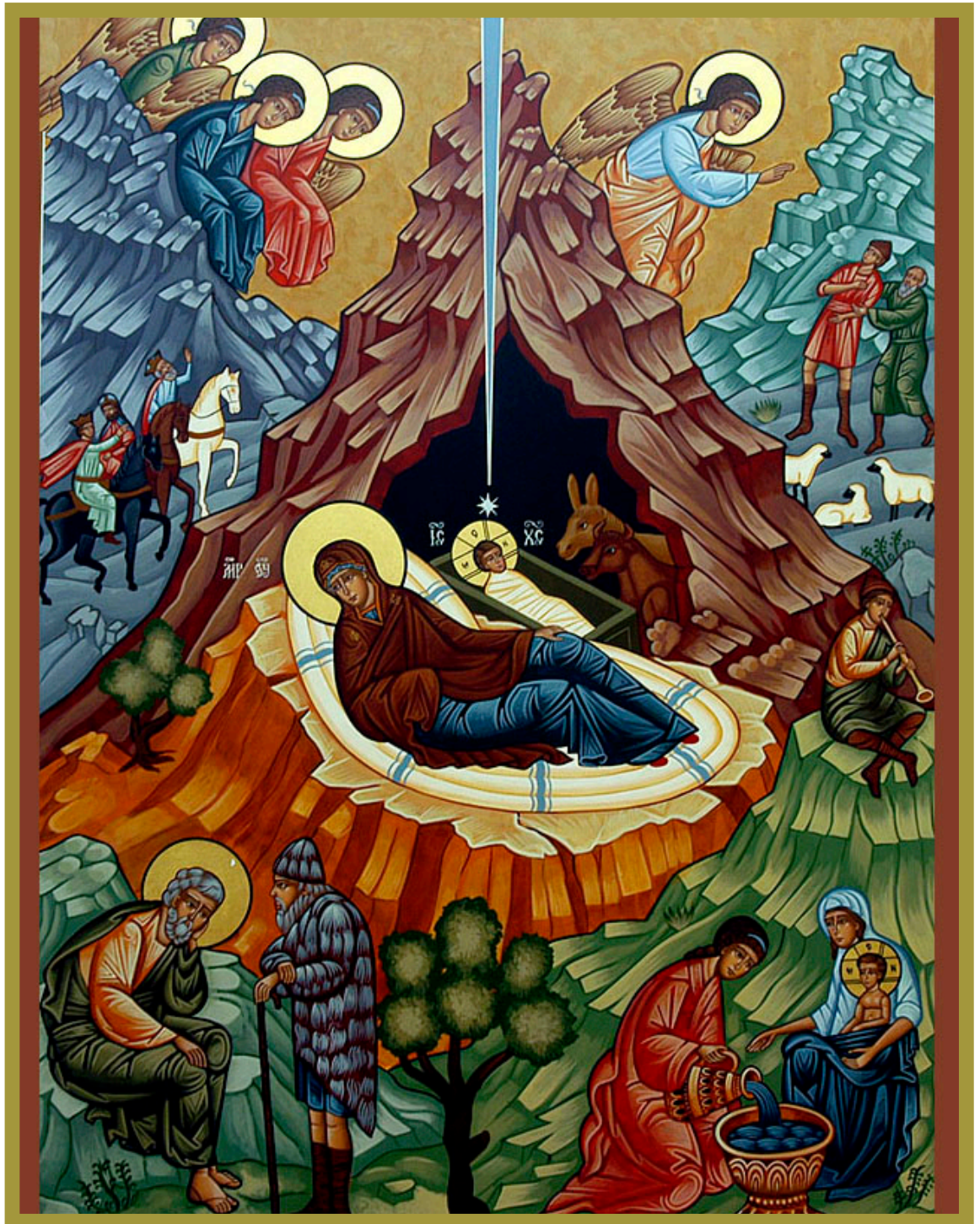
Sunday before the Nativity

St. Nicholas Website: stnicholaspittsfield.org