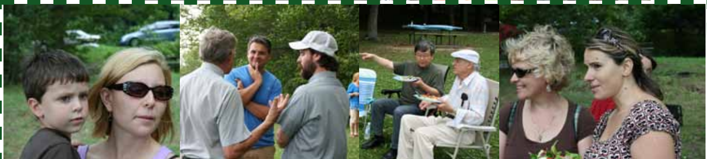
Annual Summer Picnic at Onota Lake