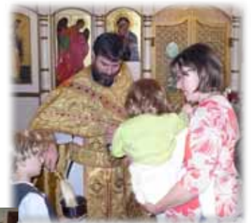
Blessing of our children on the first day of church school.

St Nicholas Orthodox Church • 76 Wahconah St. • Pittsfield, MA 01201