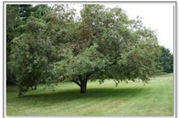
A beautiful apple tree spreads its arms over our new land

(St. John Chrysostom Homily IV, 3, 4. on Matthew)